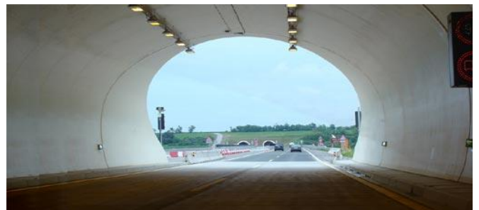
M6/M60 Tunnels in Hungary