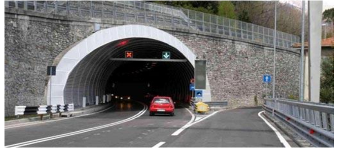
Galleria di Musso-Dongo, Musso