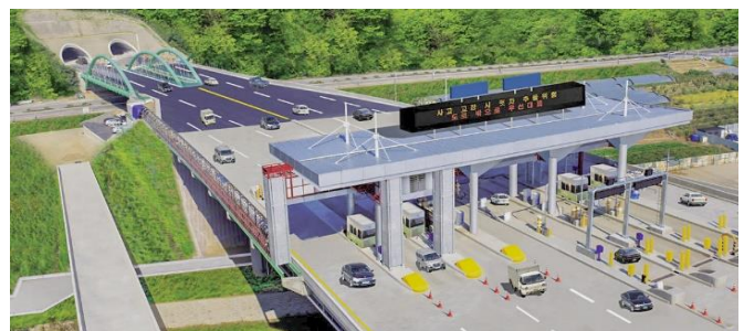
Yongma, South Korea