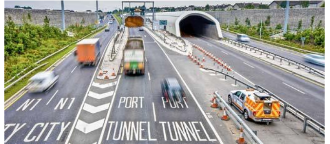
Port Tunnel, Dublin