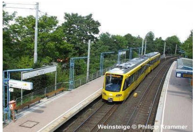
City Railway, Gerlingen

City Railway, Gerlingen Main Railway Station, Düsseldorf Railway Station Rathaus, Hamburg Trade Center, Düsseldorf Waldau-Wernhalde, Stuttgart Hauptbahnhof Railway Station, Bochum Cold Store, Düsseldorf IKW Wähltitz Neckarwerke Powerplant, Boxberg Powerplant, Cottbus Power Plant, Kiel Steel Plant, Eisenhüttenstadt Storage Area KKW, Gunderemmingen Storage Area KKW, Biblis Bay Arena Stadium, Leverkusen Airport, Frankfurt Cement Plant, Bernburg Communication Tower Alexander, Berlin Concert House, Freiburg European Aeronautic Defense and Space Company, Ulm Jail Building, Wuppertal Theatres (Regentenbau), Bad Kissingen Museum, Abteiberg Museum Of European Arts, Berlin Palaisquartier, Frankfurt Social Security Office, Berlin Treptowers, Berlin Admedes, Pforzheim, Kino Polis, Aschaffenburg