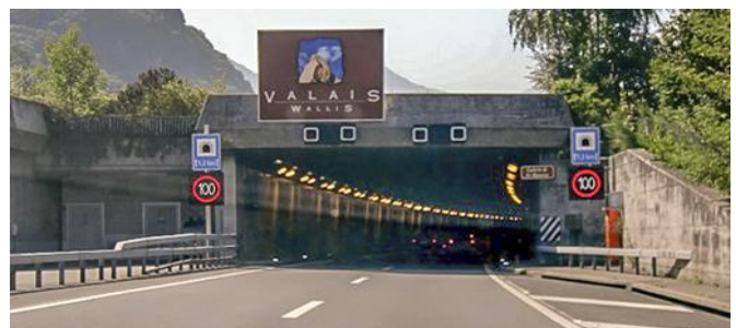
Tunnel St. Maurice, St. Maurice