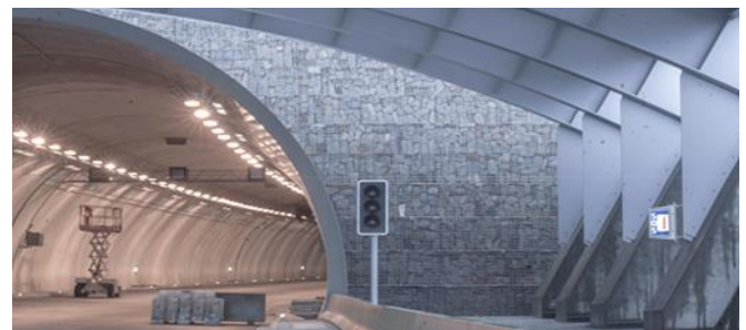
Grouft Tunnel, Blaschette, Luxemburg