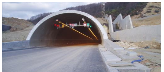
Bolu Tunnel, Turkey