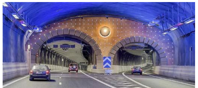
Södrälänken Tunnel, Stockholm