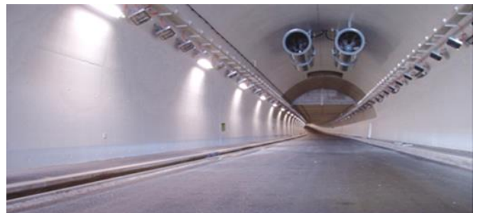
Tunnel de la Trême, Bulle