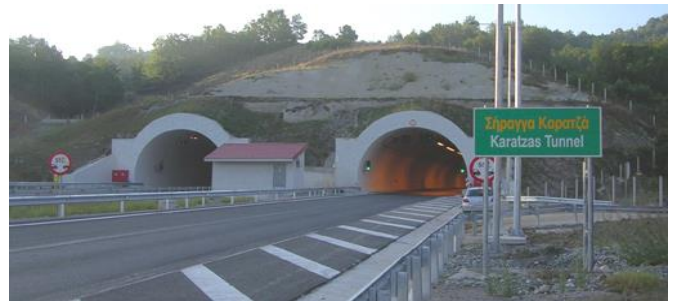
Karatzas Tunnel, Greece