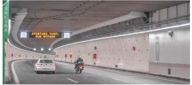
M30 Airport Tunnel, Madrid