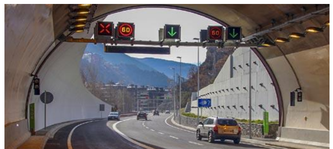
Túnel de la Tàpia, Andorra