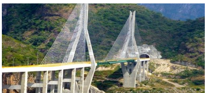
El Sinaloense, Durango, Mexico