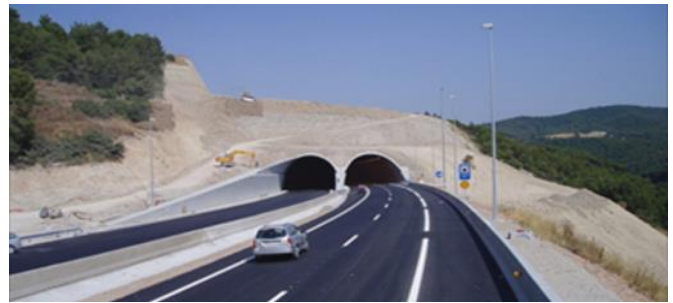
Túnel de Violi, Violi