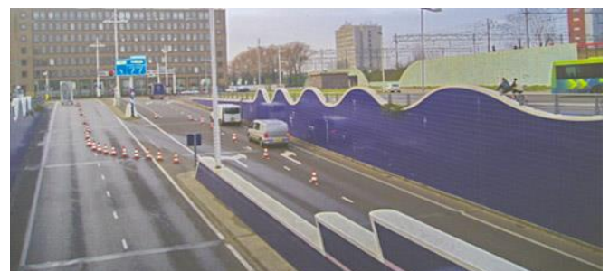
Tunnel Leiden, Leiden, Holland