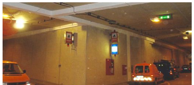
Wiener Platz, Dresden