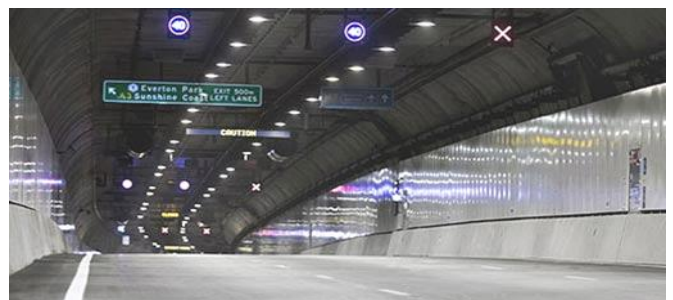
Airport Link, Brisbane, Australia