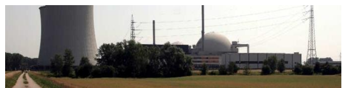
Storage Area KKW, Biblis