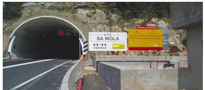
Sa Mola, Mallorca