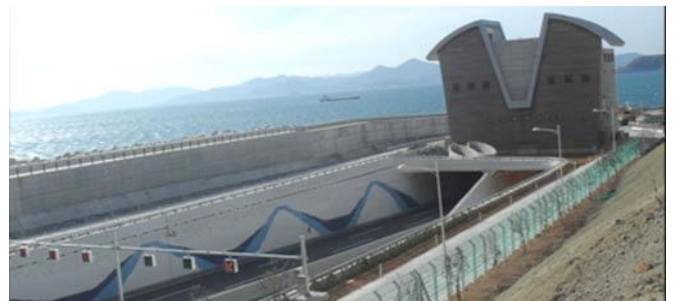
Chimnae, South Korea