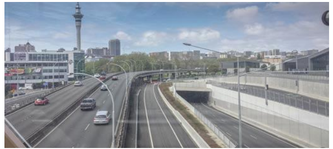
Victoria Park Tunnel, Auckland, New Zealand