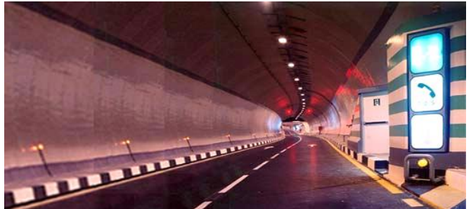
El Azhar, Cairo, Egypt