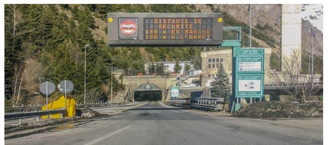
Frejus Tunnel, Frejus, France