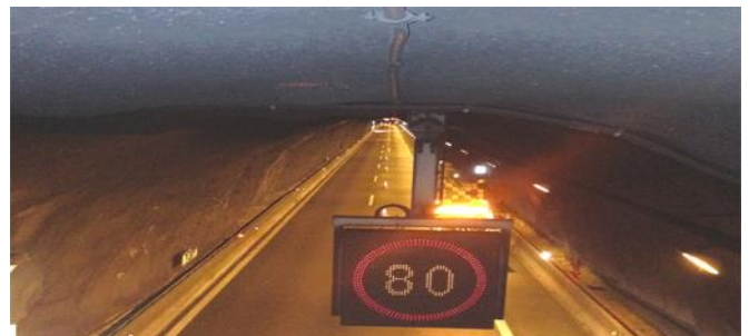
Túnel C32, Sitges