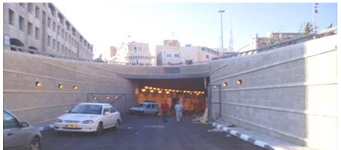
Kikar Zahal, Jerusalem