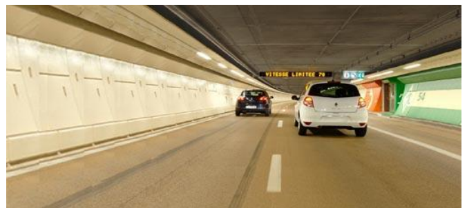
A86 Double Deck Tunnel, Paris