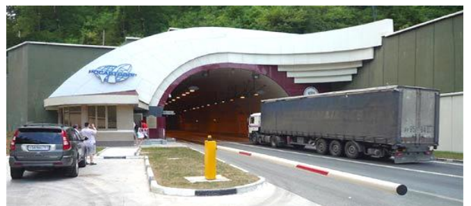
Bypass Tunnel, Sochi, Russia