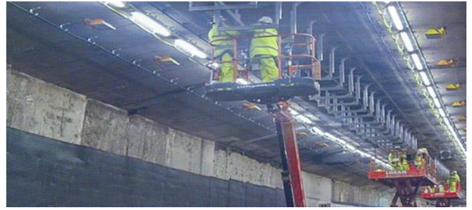
Fore Street, London