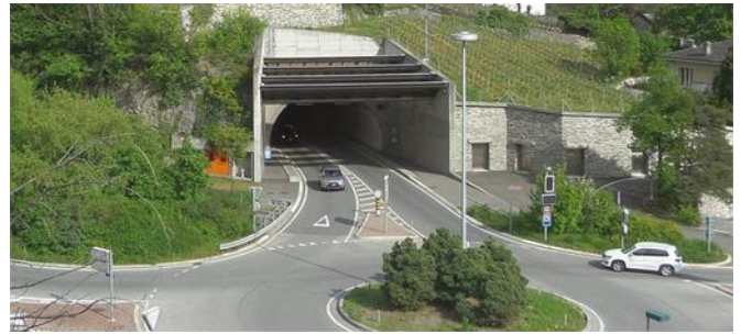
Tunnel de Platta, Sion